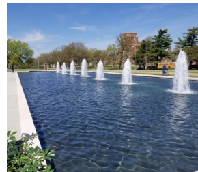
Delbert J. Haff Fountain Swope Park Kansas City Parks and Recreation Department; Walter P Moore; JE Dunn Construction, Custom Engineering; Vireo; Hydro Dramatic