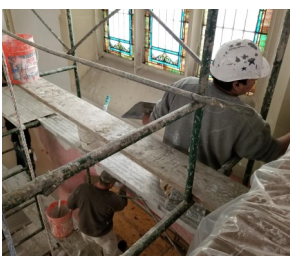
Retropros St Vincent de Paul Catholic Church 3106 Flora Ave

KC Museum (Corinthian Hall) 3218 Gladstone Blvd