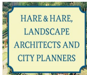
Hare & Hare, Landscape Architects and City Planners

Awarded to a group or individual for an outstanding publication in preservation, history, urban design or a related topic.