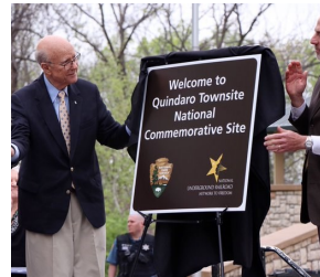
Quindaro National Commemorative Site N. 27th St. & Missouri River

Individual or joint partnership that has championed historic preservation, planning, or public policy.