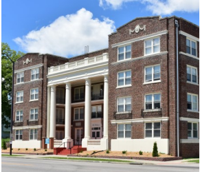
Gotham (Aurora, Agee) Apartments 2718, 3012-14, 3200-3218 E. Linwood Blvd IDP Properties; Baron Design & Associates; Hamilton Builders; Grandbridge Real Estate Capital, LLC; Rosin Preservation

Awarded to a project, individual, business or group that has greatly contributed to the revitalization of a historic neighborhood or reclamation of abandoned or poorly maintained property or structure.