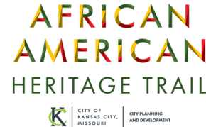
African American Heritage Trail City of Kansas City, Missouri City Planning and Development Department

Awarded to projects that show innovation (such as Blue and Green Architecture, Financing, Technology) and push the preservation movement forward.