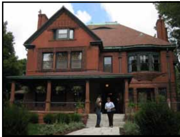
600 East 36th Street